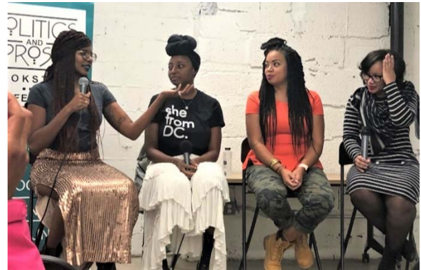
Authors Nic Stone, Ashley Woodfolk, Tiffany D. Jackson, and Dhonielle Clayton

It was a small event at an intimate setting and the trio from Academy Park enjoyed listening to the authors discuss their histories, writing goals and how they came into the writing profession. A great time was had by all!